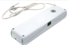
Option MAC Motor 230v, 24v 150mm only £175