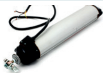
Option AU-Max Electric Linear actuator 230v 300mm

We offer a number of different motors for the Pyramid Rooflight. Motors are installed at the cill of the roof window. You can purchase a motor and a switch from the options below.