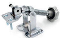
Option W – Anodised aluminium wheel on Chrome Plated hand winder 150mm £48