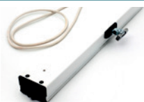
Option Super- master Motor 230v, v24v 450mm £235